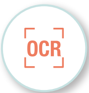
Optical Character Recognition

Higher Duty Cycles and Periodic Maintenance Intervals provide greater volume with fewer routine service calls so you can stay focused on productivity.