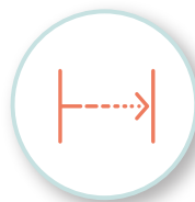
Soft Close Drawers